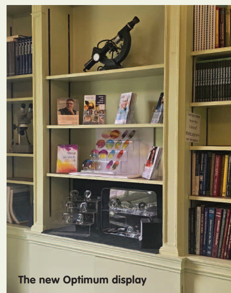
The new Optimum display

Lecturer Callum Wills said: "The Optimum tint range display shows exactly how versatile the company is. The vibrant fashion colours are fantastic, showing students from all different practices what options we can choose from."